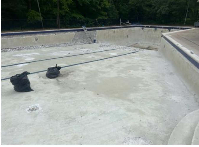
Adult Pool resurfacing