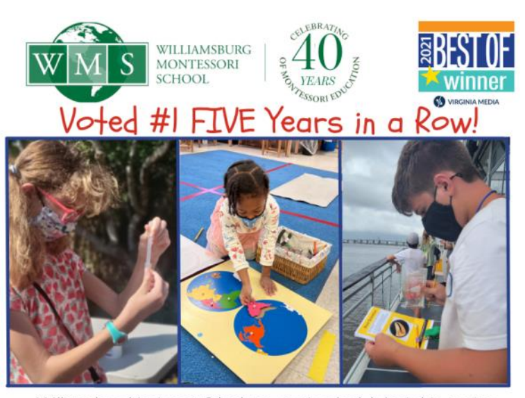
Williamsburg Montessori School is a private school dedicated to creating confident, self-reliant and self-motivated children from toddlers to adolescents who are prepared for the adventure of life. Come see our classrooms and learn what a difference a Montessori education can make for your child.

If you are looking for a way to become involved in your neighborhood, please consider joining the Membership committee. We are an energetic group that is always happy to welcome new members.