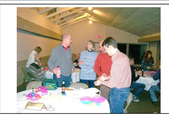
Cuatro de Mayo