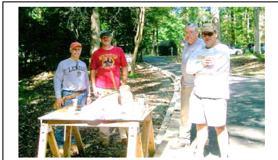
HOLCOMB LAKE ACCESS VOLUNTEERS