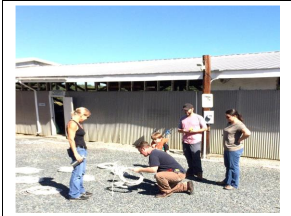
MARINA WORK DAY